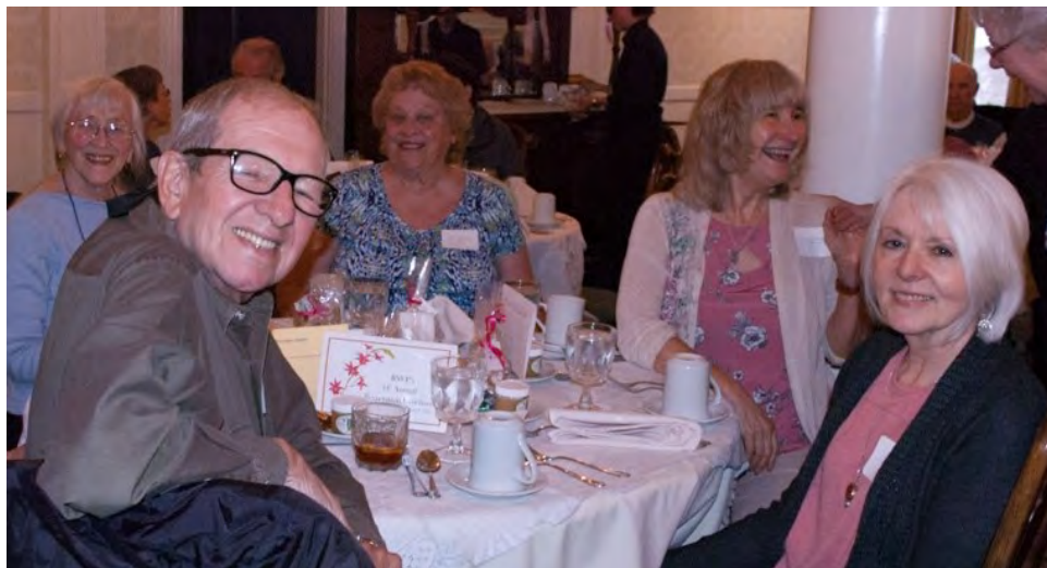
A good time was had by all!