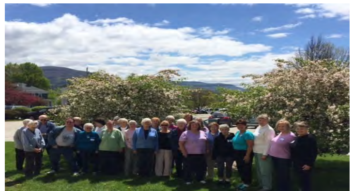
RSVP Bone Builders instructors enjoy getting together for our annual Refresher Workshops.